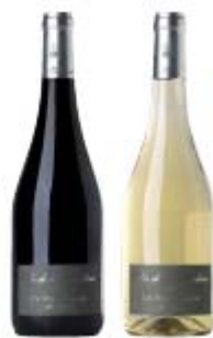
Les Vingt Poinçons de Blois